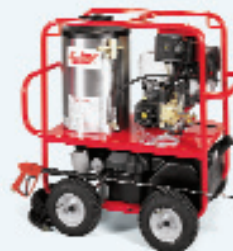
Model 1065SSE 3.5 GPM @ 3000 PSI; 11 HP Honda OHV electric-start gas engine; 12V DC water heater (12V Battery required, not supplied) Electric-start engines available on 11 & 13 HP Honda models