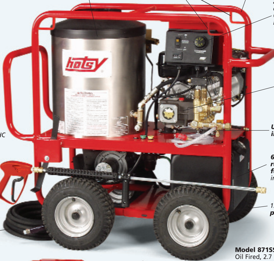
Model 871SS: Oil Fired, 2.7 GPM @ 2400 PSI