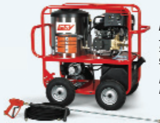
Model 965SS 3 GPM @ 3000 PSI; 9 HP Honda OHV gas engine; 12V DC water heater (Battery not required)